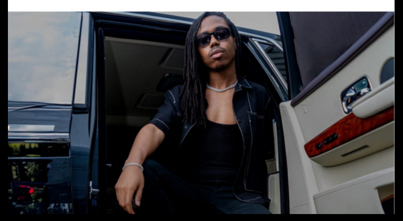
CLICK TO READ