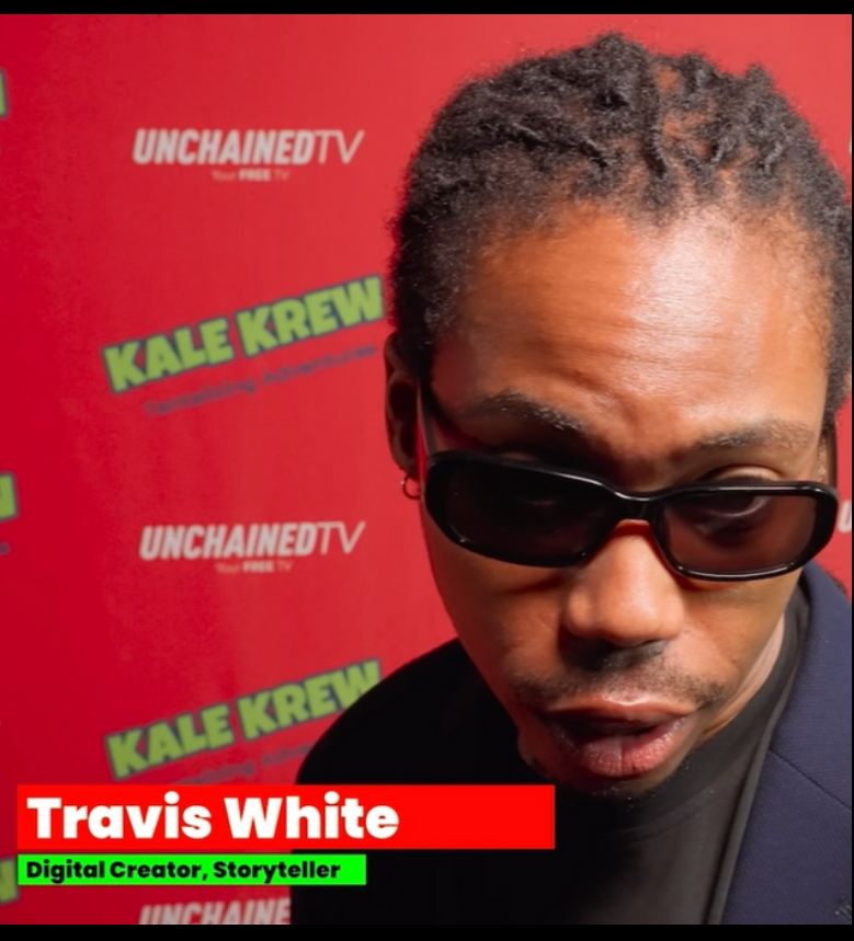
THE KARDASHIANS ON HULU: MANAGER CLICK TO WATCH UNCHAINED TV: KALE KREW LA: TALENT CLICK TO WATCH